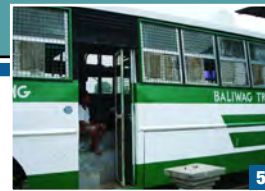
Back in 2005, older SMDP boys slept on bunk beds in a converted city bus (5). Today they are housed in an 80-bed dormitory (6) that also has a library and study