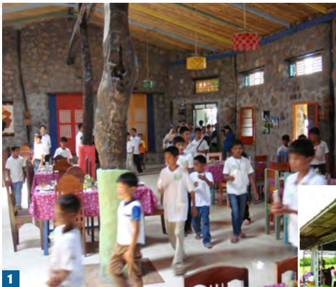
Unlike the old open-air dining area (2), where the children had to eat in shifts, the new dining-recreational hall (1) accommodates all residents for meals and community gatherings

IN 2005, THE ST. MARTIN DE PORRES home for children was but one small building that housed 30 children. Today, thanks to the generosity of JDVSF supporters it has become an actual village, where its 80 young residents have room to grow and learn how to be happily and safely self-reliant: