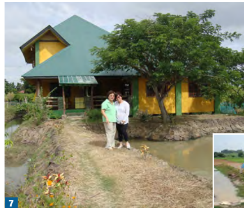
The JDVSF built small residential cottages for the girls (7 and 8), who today live in intimate family settings with house parents, caring for one another and the younger boys